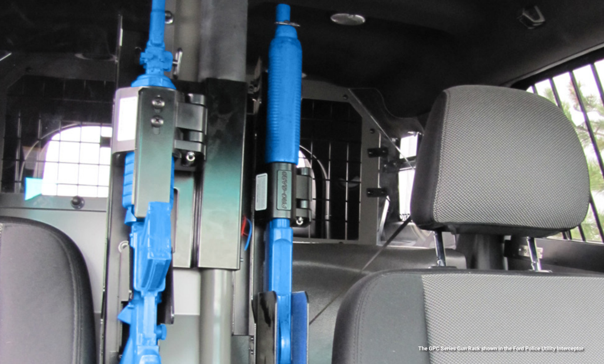
The GPC Series Gun Rack shown in the Ford Police Utility Interceptor