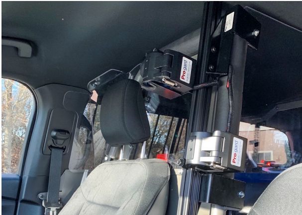
The GPC Series Gun Rack shown in the 2020 Ford Police Interceptor Utility

The GPC Series Gun Racks is engineered for use in Pro-gard's Pro-cell Half Cage Prisoner Transport System. The GPC series can be configured to fit a wide variety of weapons and mounts up to two long guns vertically on the partition.