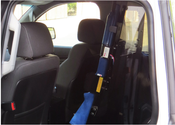
The GPC Series Gun Rack shown in the Chevy Tahoe