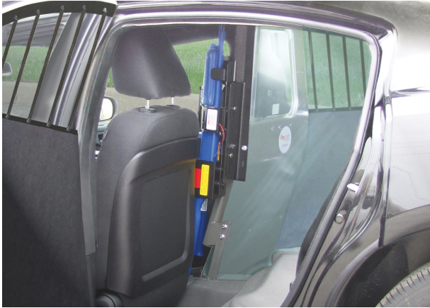
The GPC Series Gun Rack shown in the Dodge Charger